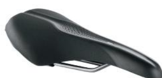
SADDLE M The all-rounder saddle