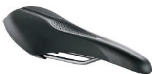
SADDLE S The athletic saddle