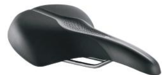
SADDLE L The particular comfortable saddle